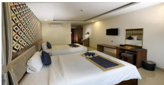
SEVEN SEA HOTEL DANANG